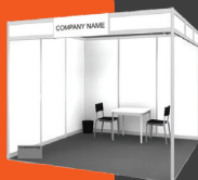
Exhibit Space Cost

CEOs, Production Managers, Engineers, R&D Heads, Academics Policymakers & Government Officials Investors & Industry Leaders in Automotive, Electronics, Pharma, Textiles, and Food Processing